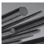
Round steel [RS] black L: 500 mm L: 1.000 mm